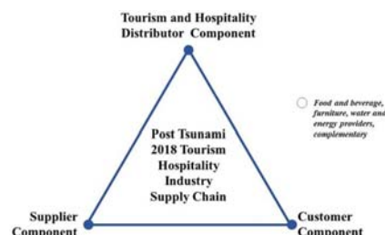
Figure 2. The Post Tsunami 2018 Tourism Hospitality Industry Supply Chain in Pandeglang

As mentioned before, tourism has a huge impact in the world and it is currently no different in Pandeglang, where coastal tourism is considered as a growing economic tool with great potential [31]. To support the recovery from the impact of the tsunami on the hospitality industry, it is important to understand the relationship between each component in the hospitality network in Pandeglang. This meant that having a proper supply chain within the tourism industry of Pandeglang is a very important aspect and an aspect that is being worked upon by many different organizations such as PHRI Pandeglang, HPI Pandeglang, Association of The Indonesian Tours and Travel Agencies (ASITA) Pandeglang, and many other different organizations while also being backed by the government. The following provides results hospitality supply chain as drawn in figure 2.