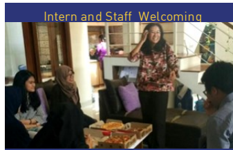
Intern and Staff Welcoming