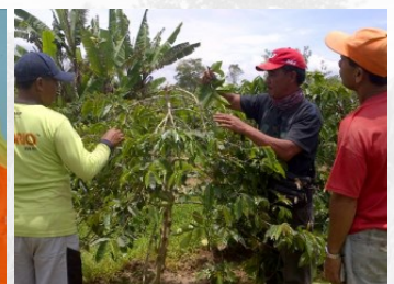
Coffee Farmer in Karo