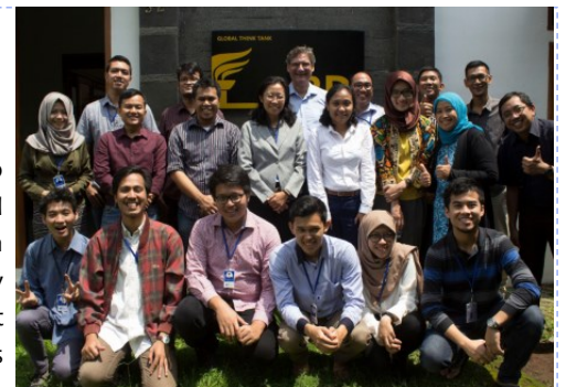
Workshop participants and team