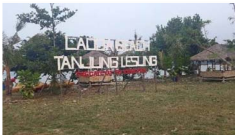
Figure 1. Pandeglang Tourism Area in 2019

2019. Moreover, during the long weekend holiday in October, the occupancy rate of a number of hotel attractions in Pandeglang Regency has increased to 100%. The good news was confirmed by the representatives of Mutiara Carita Hotel and Tanjung Lesung Hotel. They are doing their best to tighten the health protocol in their operations because the pandemic is still far from over, despite the implementation of the new normal [61]. Representative of the Head of the Banten Province Tourism Office also stated that tourist attractions that have been opened in Banten Province are those that have passed the assessment test from the Banten Tourism Office [62].